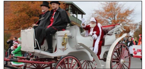
PAGE 4 UPCOMING EVENTS