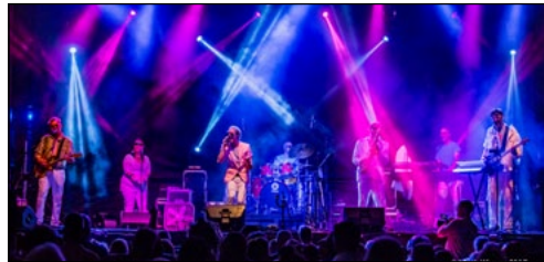
PAGE 3 CONCERT IN THE PARK