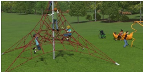
PAGE 2 PLAYGROUND EQUIPMENT