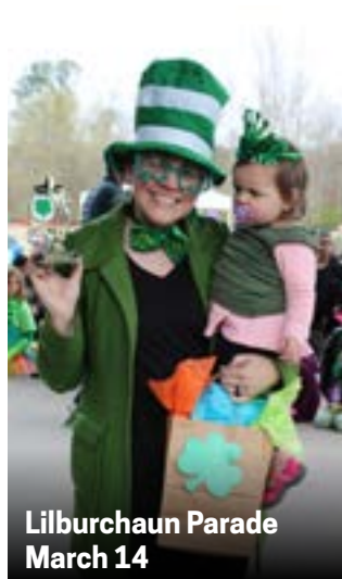
Lilburchaun Parade March 14

Taste of Lilburn is returning to Lilburn City Park on Saturday, May 2. Sample a variety of restaurants while at the event. Visit cityofilburn.com for more details and ticket information. Look inside to find out more about these and other events taking place this year!