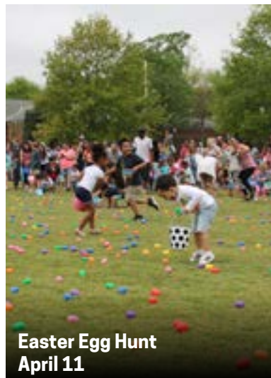
Easter Egg Hunt April 11