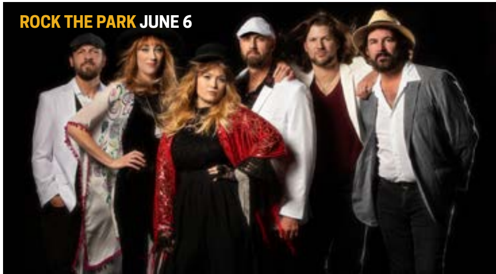
ROCK THE PARK JUNE 6